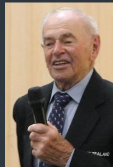
Mr Bernie Fraser Archery NZ Patron