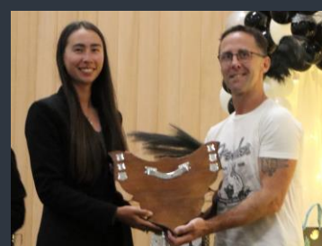
The Hamilton Shield 2023 winners Grey Goose Wing Archery Society (A)