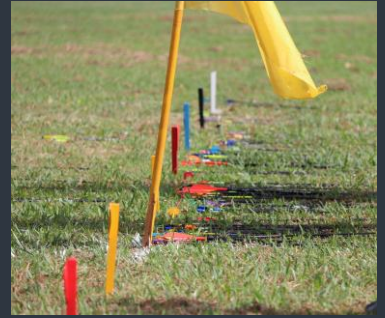
Clout: The arrows that were found (above) and the arrows that weren't (below).

We will notify you once these are available, alongside supporting material.