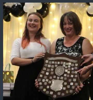
The Ryan Shield 2023 winners Mountain Green Archery Club