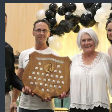
The Fraser Shield 2023 winners Manawatu Archery Club